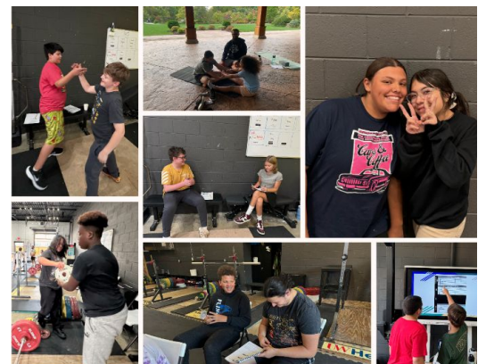
Rockford Barbell Self-Regulation Program