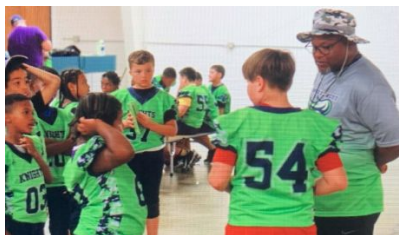
Northwest Community Center Youth Football and Educational Program

It is important to solidify a plan on how you will measure your results and the tools you will use. Examples: surveys, how many participants attended, or receipt for item purchased. You are expected to submit a final report by the following December to tell us the outcome of the charitable activity using the methods of measurements you stated in your application. If you do not submit a final report you may not be eligible for funding in the future.